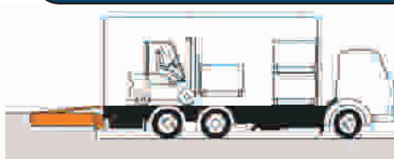
LIFT TRUCK LOADING TWO PALLET HIGH 1 Man @ 1/4 Hour = 1/4 Man Hours