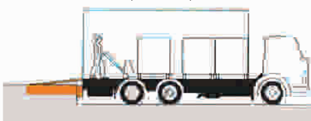
HAND PALLET TRUCK UNLOADING 1 Man @ 3/4 Hour = 3/4 Man Hours