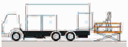
SEMI-PORTABLE ELEVATING DOCK 1 Man @ 3/4 Hour = 3/4 Man Hours