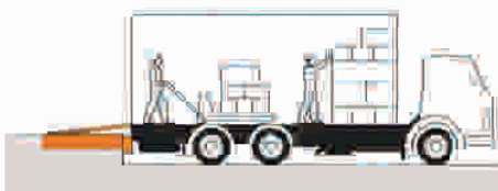
PALLETISING ON VEHICLE OR CONTAINER FLOOR 2 Man @ 3/4 Hour = 1 1/2 Man Hours