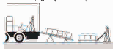
DEPALLETIZING, CONVEYORIZING, DECONVEYORIZING AND HAND STACKING 2 Men + Ramp @ 3 Hours = 6 Man Hours