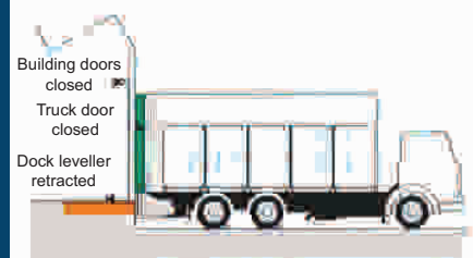
SECURE AND READY FOR DESPATCH