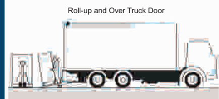
QUICK TRANSFER INTO DISTRIBUTION OUTLETS