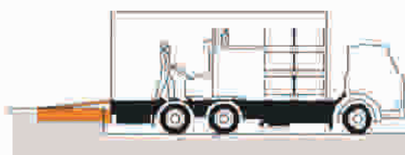
WALKIE STACKER UNLOADING 1 Man @ 1/2 Hour = 1/2 Man Hours