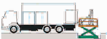
ELEVATING DOCK 1 Man @ 3/4 Hour = 3/4 Man Hours