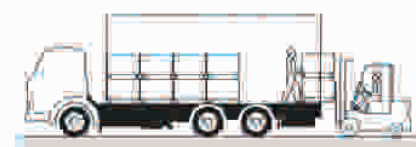
DEPALLETIZING FROM FORKLIFT TRUCK 2 Men @ 1 Hour = 2 Man Hours