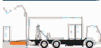
LOADING AT WAREHOUSE OR FACTORY 1 Man @ 3/4 Hour = 3/4 Man Hours