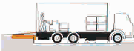
POWERED PALLET TRUCK LOADING 1 Man @ 3/4 Hour = 3/4 Man Hours