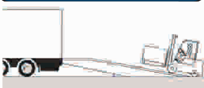
MOBILE RAMP REQUIRES ADDITIONAL YARD SPACE AND HIGH GRADABILITY LIFT TRUCK 1 Man + Ramp @ 1 1/4 Hours = 1 1/4 Man Hours